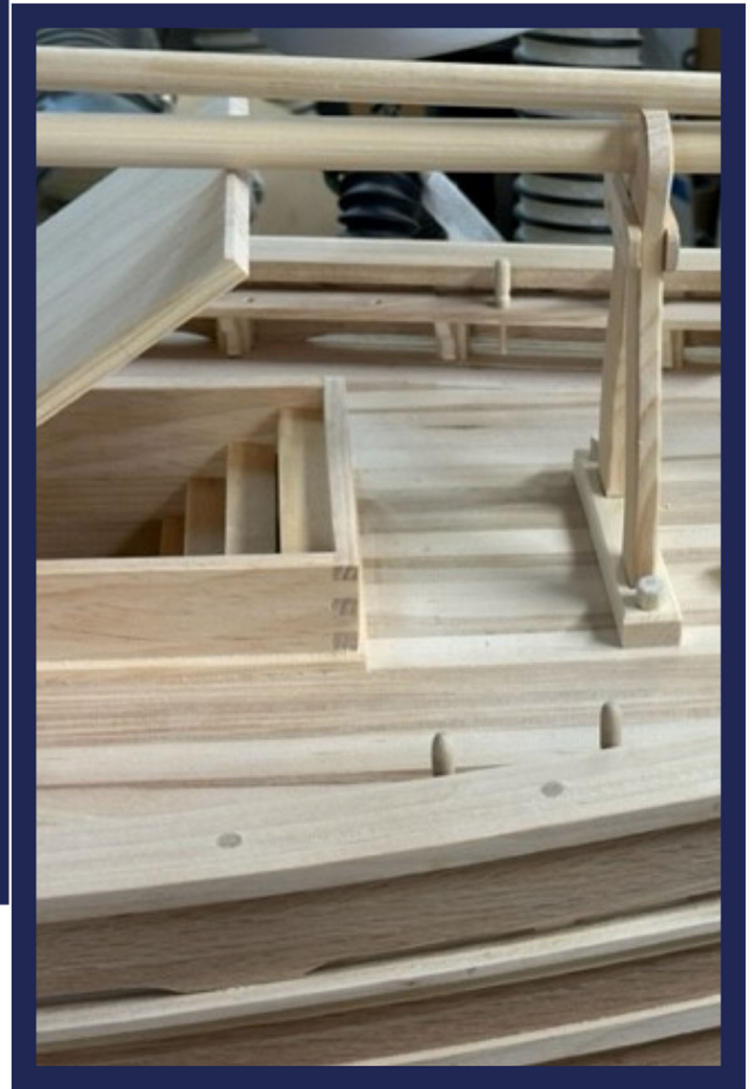
(Right) Intricate detail on the ship

Norwegian Lutheran Memorial Church 924 East 21st St., Minneapolis MN 55404-2952 612-874-0716 | mindekirken.org Office Hours: 10 am - 3 pm Tuesday - Friday