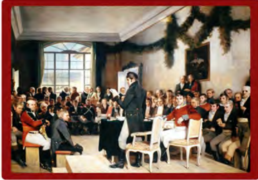
The 1855 painting “The National Assembly at Eidsvoll 1814” by Oscar Wergeland depicts the signing of the Norwegian Constitution.

More at www.democracy.norwegianamerican.com