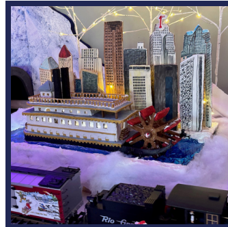
Gingerbread Wonderland at Norway House