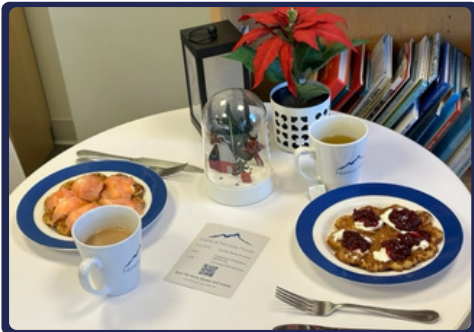
Lunch at Norway House

For more information and tickets, visit www.mindekirken.org (click Events) Final date for ticket sales is December 29-- please inquire with office after this date for availability